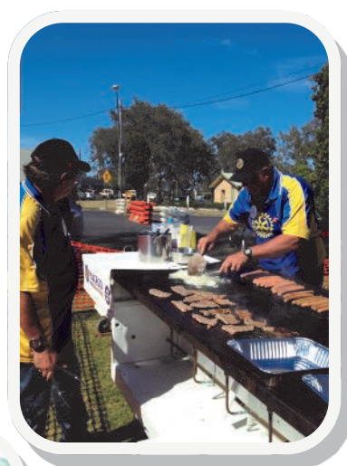
Above: Cooking and more cooking – it's great to feed the masses.